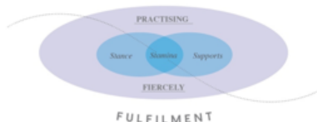
Figure 2. Practising fiercely: Fulfilment through stance, supports and stamina

A thematic analysis of specialist teachers' stories (Braun & Clarke, 2006) guided the development of a framework for harmonising who teachers are with what they do (Korthagen, Kim & Greene, 2012). This is a framework for fulfilment comprised of five separate but interconnected elements. Fulfilment connotes teachers' sense of living and working in ways that embody their values. Practising fiercely includes the ways teachers frame and co-create their roles to enact their stance, supports and stamina in harder and softer ways. Stance and Supports contribute to our Stamina. Each construct has individual and collective aspects, signified by the diagram's wavy line.