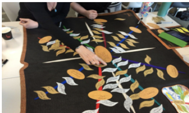
Figure 1. Participants engaging in one Ketso® activity

Ketso®, a structured concept mapping tool for participatory research (Furlong & Tippett, 2013) was used in both formal group meetings to develop participants' thinking and collaboration, and to genuinely bring local knowledge to solution-finding (Tippett, Handley & Ravetz, 2007, p. 9). The tool enabled essential components of research alongside Māori, including: Māori knowledge; relationships; self-awareness; relevance; power-sharing, and unleashing potential (Macfarlane & Macfarlane, 2013).