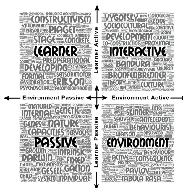
Figure 1. The matrix of perspectives. (Adapted from Bowler, Annan & Mentis, 2007).

the results of a study examining, (a) the alignment of a group of educational professionals' espoused theories of learning with their reported practices, and (b) the perceived usefulness and application of the LTP for practice.