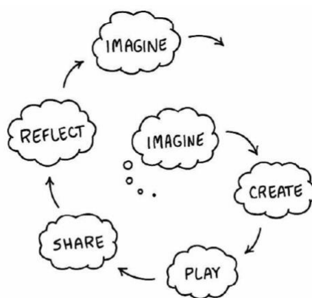
Figure 3. Continuum of creative learning spiral (Resnick & Robinson, 2017)

The close compatibility between inquiry-based learning and PBL is further highlighted by Resnick and Robinson (2017), who endorse an inquiry-based approach and advocate the use of a 'Creative Learning Spiral' (Figure 3). They regard this as the 'engine of creative thinking', allowing students to develop and refine their abilities as creative thinkers. However, this is not how the vast majority of students learn beyond ECE and junior primary, where the focus is often results and content driven. Nevertheless, Resnick and Robinson (2017) oppose this and highlight the learning benefits for their university students within the Media Lab programme at the Massachusetts Institute of Technology (MIT), where they have adopted an inquiry-based learning approach. This reinforces the premise that students of all ages benefit from some of the pedagogies that underpin PBL.